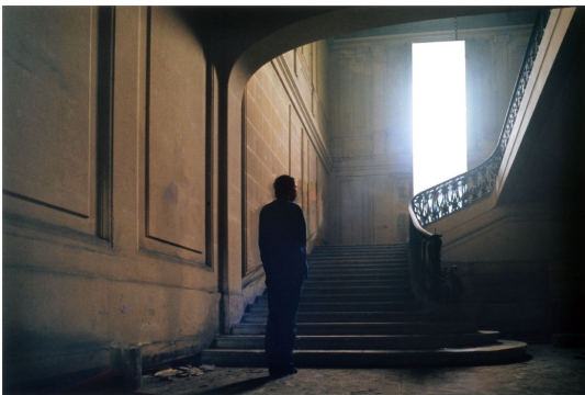
Figée dans l'instant, 1977 (2018)