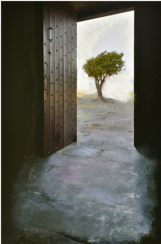
Cache-cache, 2016 (2018), Oil on C-print, 19 x 15 in