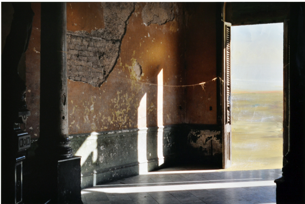
Carrelage, 1999 (2018), Oil on C-print, 15 x 19 in

Following the recent exhibition at the Chanel Nexus Hall, Tokyo, this show will include oil paintings as well as an array of astonishing Type-C prints with hand-applied oil paint, making each work unique.