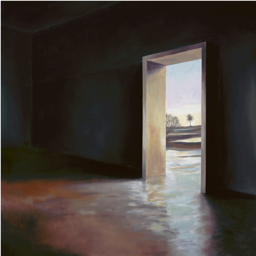
Espalmador, 2016, Oil on canvas, 40 x 40 in

JUNE 29 – SEPT. 7, 2019 OPENING SATURDAY JUNE 29, 5-7pm